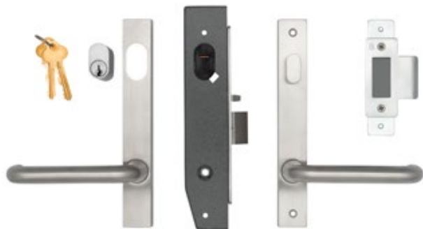
Cylinder and Turn Kit