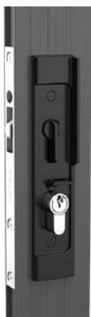
Sliding door lock