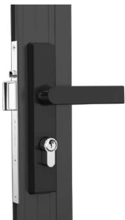
Hinge door lock