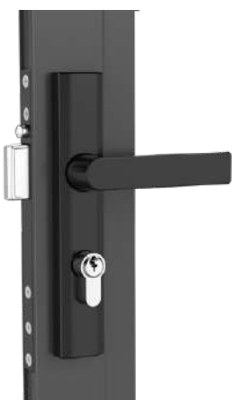
Hinge door lock