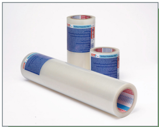
For indoor and outdoor use.