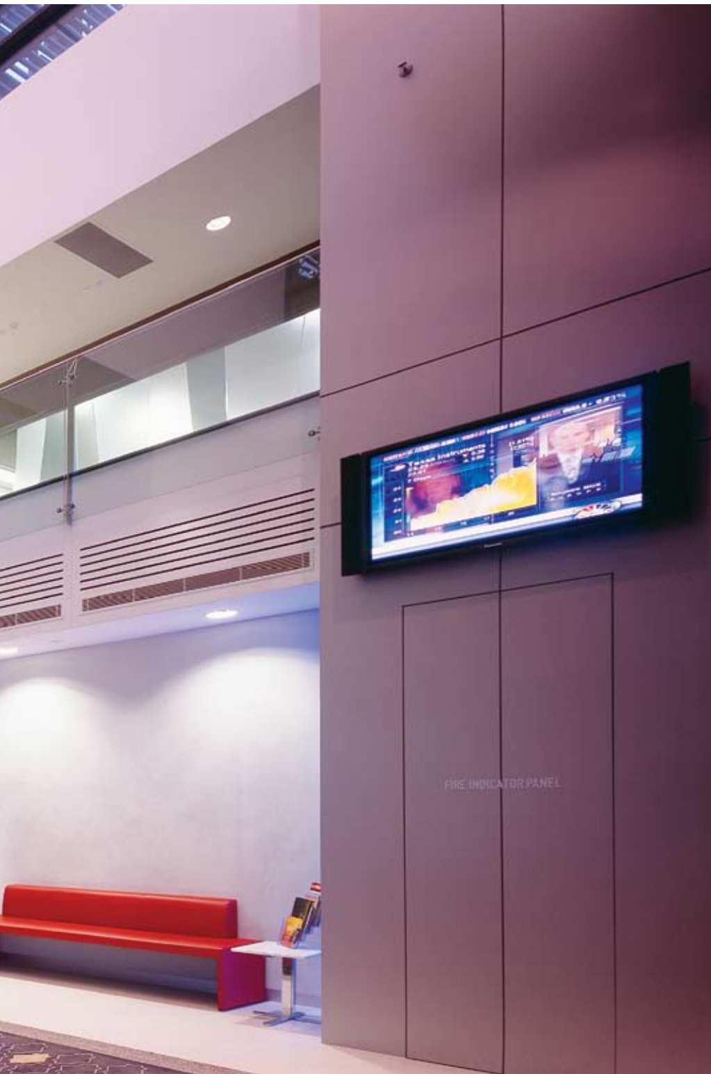
ABOVE Main Reception and Entry Lobby with glass lifts at rear