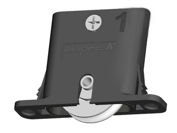
ALSPEC Offset Security Door Roller SS 40kg: Tested for 100,000 cycles at max weight!