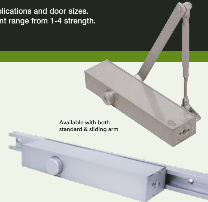
Available with both standard & sliding arm