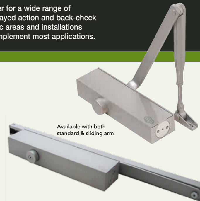
Available with both standard & sliding arm