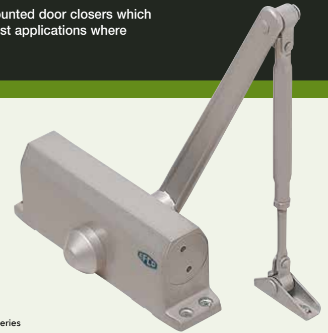
Retrofit to Ryobi 60 series