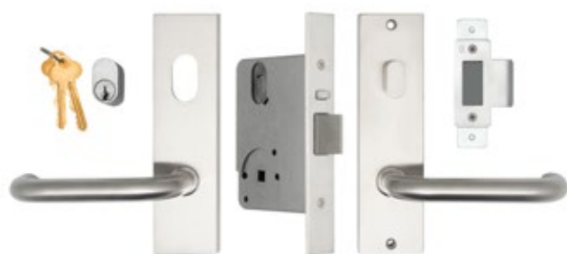
Cylinder and Turn Kit