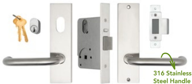
Single Cylinder Kit