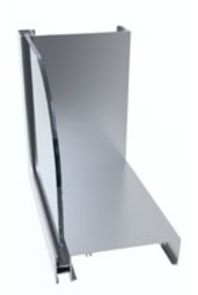
101.6 x 50mm